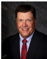
Founder / President