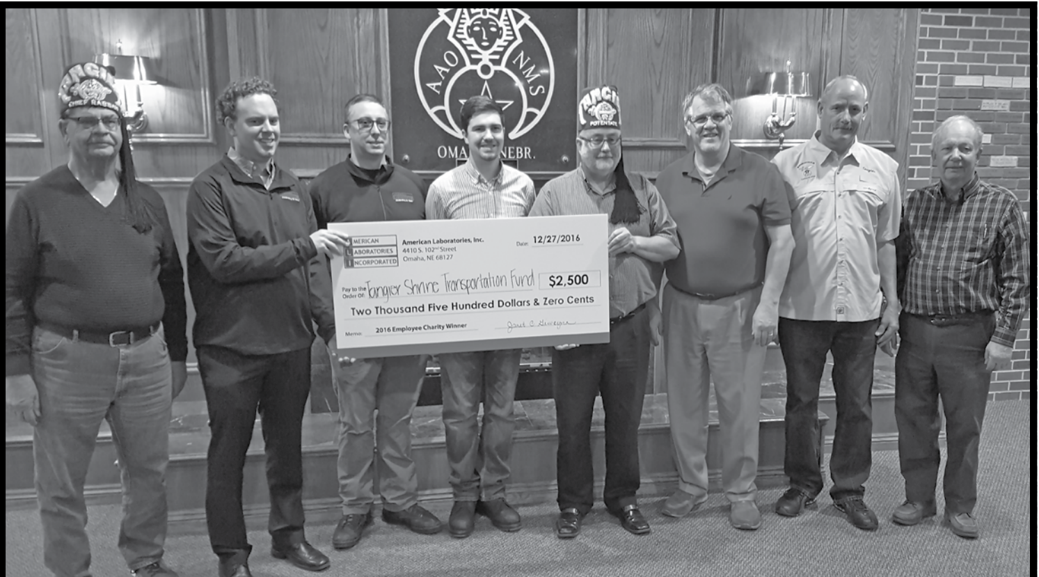
Donation from American Lab Employees to the Tangier Shrine Transportation Fund.